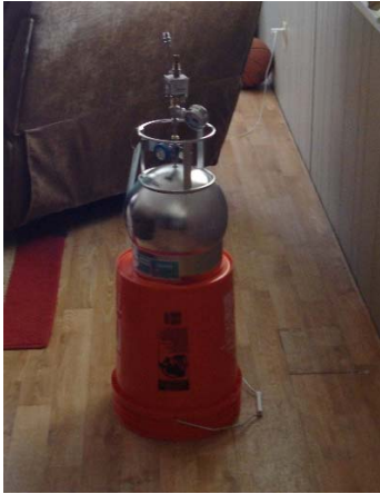
April 2014 - Summa canister collecting an indoor air sample over a 24-hour period.

Because sample results for all three homes that were tested in April 2014 exceeded the RML, collection of samples at other nearby homes and outdoor air is currently being planned for the week of June 23-27, 2014.