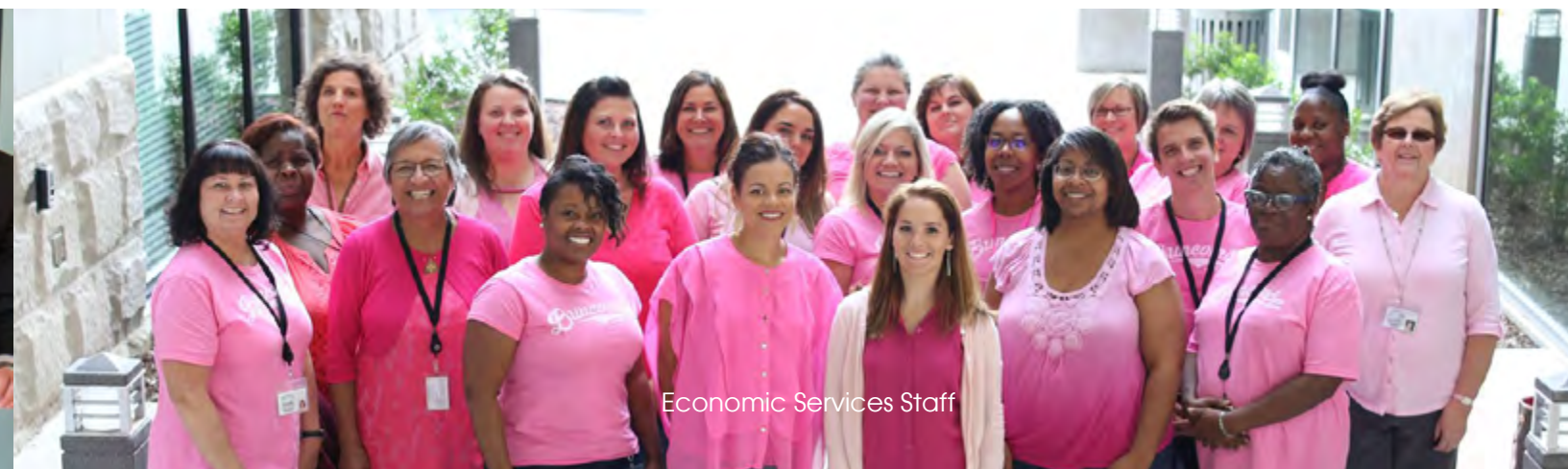
Economic Services Staff