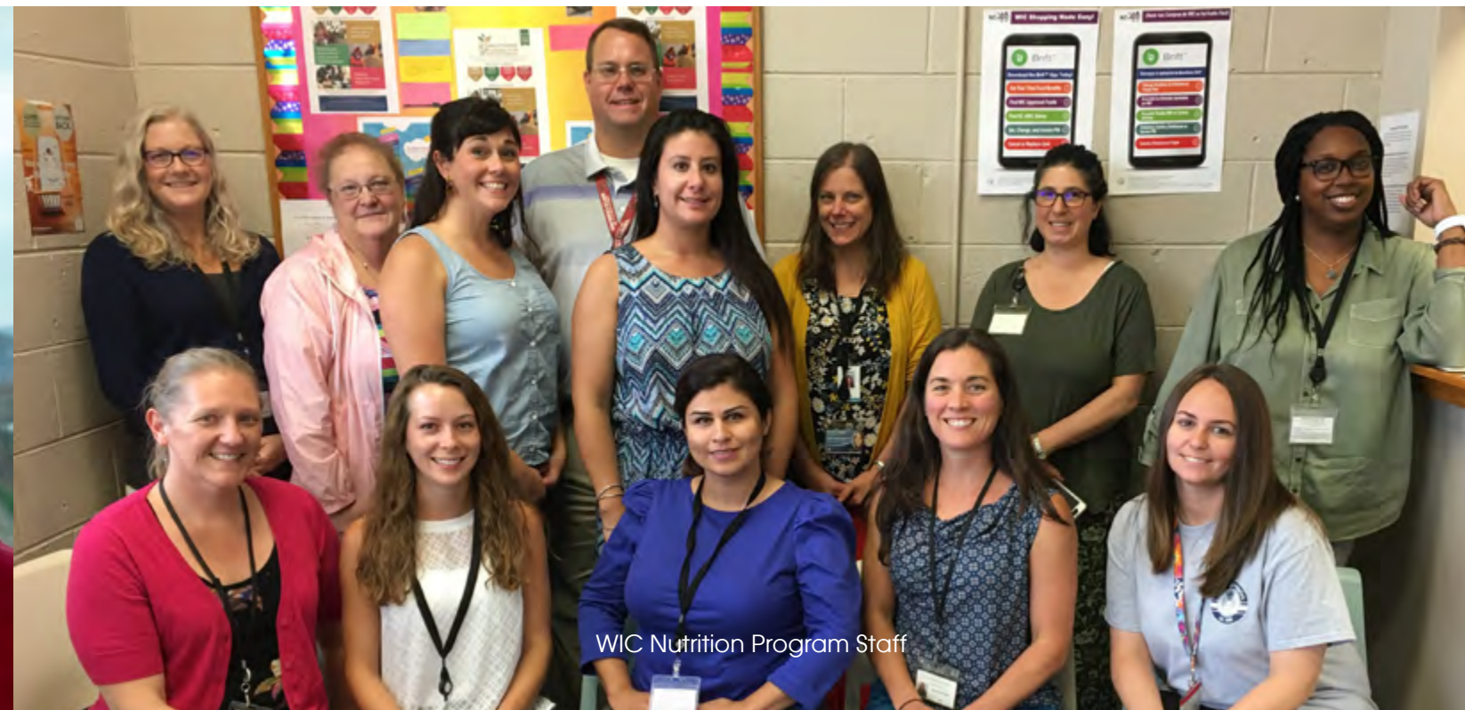
WIC Nutrition Program Staff

The North Carolina WIC Program moved from a paper-based method of WIC benefit issuance to an electronic benefit transfer system called eWIC. eWIC makes it easy for clients to use their WIC funds on one convenient card when they buy healthy foods at the grocery store. WIC food benefits will now be issued into an electronic benefit account at the local WIC clinic and families will use their eWIC card and PIN to use their food benefits at the grocery store.