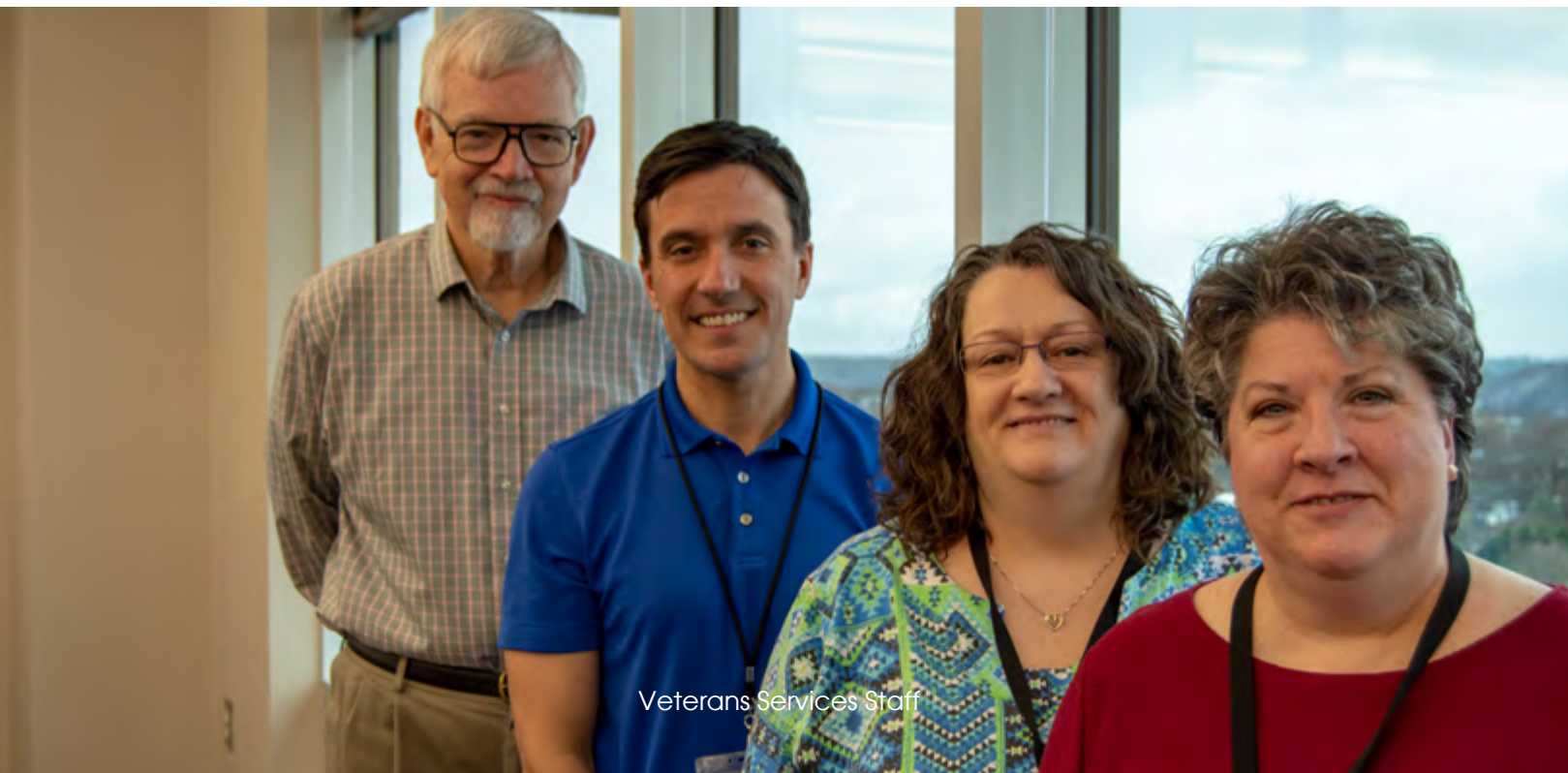
Veterans Services Staff

Buncombe County Veterans Service Officers act as liaisons between veterans and their families in the often very complicated and confusing process of obtaining benefits from the Department of Veterans Affairs. Veterans Service Officers assist in linking the veteran with housing, employment, and medical resources. In FY 2018, the Veterans Services Officers made over 994 points of contact with veterans in Buncombe County, either by phone, in the office, or home visits. The average accrued and grand total payments to veterans were $312,911 (monthly).