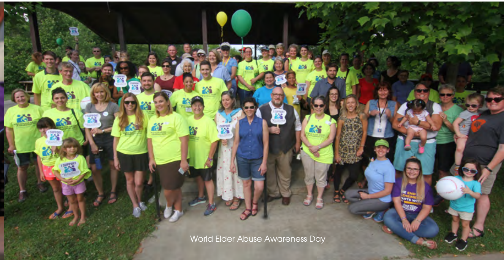
World Elder Abuse Awareness Day