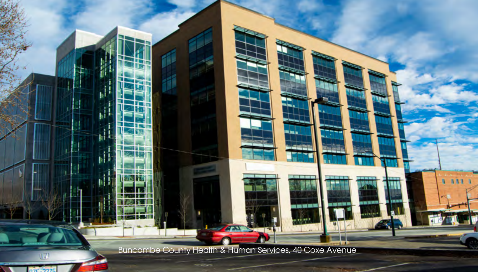
Buncombe County Health & Human Services, 40 Coxe Avenue