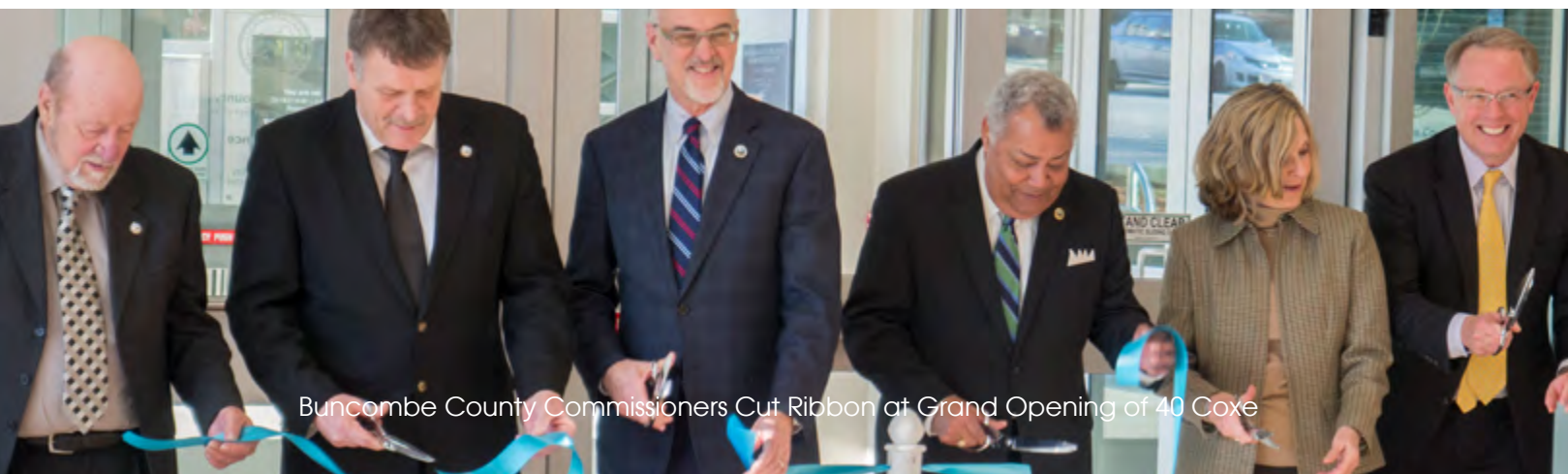
Buncombe County Commissioners Cut Ribbon at Grand Opening of 40 Coxe