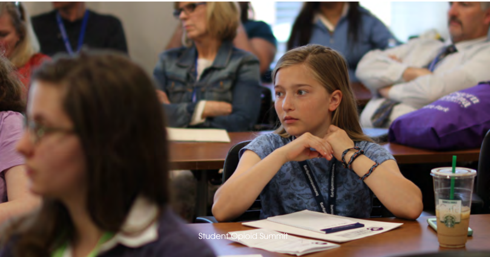
Student Opioid Summit

The World Elder Abuse Awareness Day Walk (WEAAD) was held on June 12, 2018, at Carrier Park. BCHHS, Land of Sky and several other organizations that support elders, collaborated to make the 2018 WEAAD Walk an event to remember. Over 250 people showed up for the event to show support for elders and raise awareness about elder abuse.