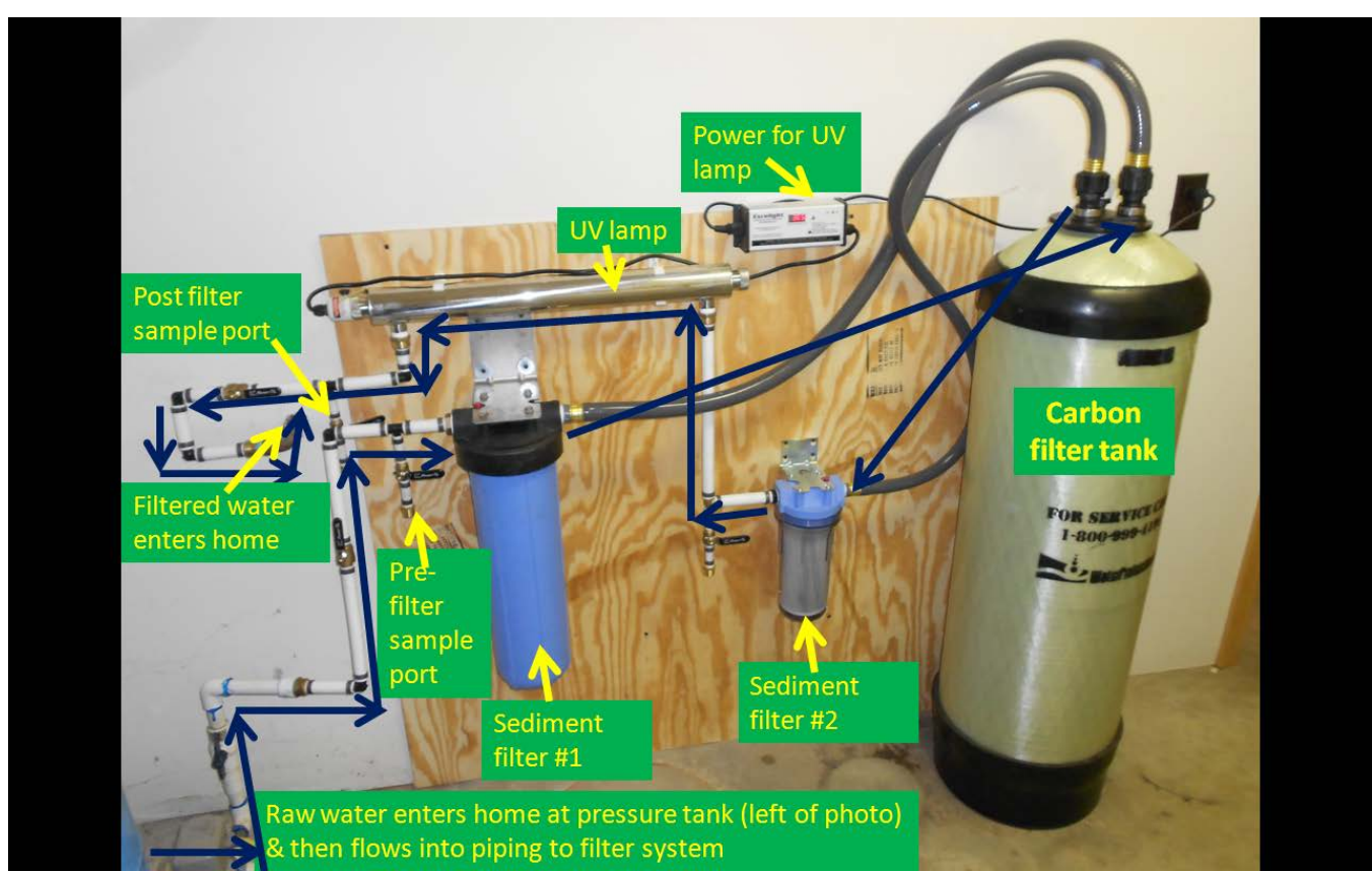
Photo of a system installed at a home in September. Water enters at bottom left of photo from the well/pressure tank and then flows through the system as indicated by blue arrows.

Culligan began installing filtration systems on September 11, 2012. As of October 18, 2012, filtration systems have been installed in 38 homes. For those that have accepted the offer, EPA will contact you in the near future to schedule the installation appointment. The standard installation will take approximately 4 hours and will be performed by a licensed plumber.