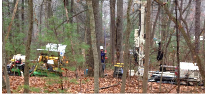
MiHpt boring location #50

plant property during December 16-20<sup>th</sup>. The contractors will then take a two week break for the holidays and return to work on January 6, 2014.