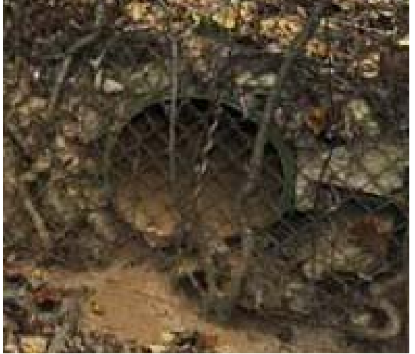
Empty barrel at the fence line near the back of the CTS Site

will continue. The next quarterly well water sampling event is planned for the 2<sup>nd</sup> week of January.