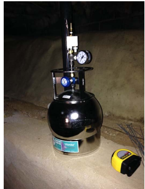
April 2014 - Summa canister collecting a crawl space air sample over a 24-hour period.

A few months ago, the property owners adjacent to the eastern fence line gave CTS Corporation and EPA permission to conduct the VI assessment on their properties. EPA approved AMEC's revised Vapor Intrusion Assessment Work Plan (Revision 4) on March 28, 2014, and sampling was conducted on the properties to the east of the fence line during the week of April 21-24, 2014. The sampling report is expected to be received by EPA in June.