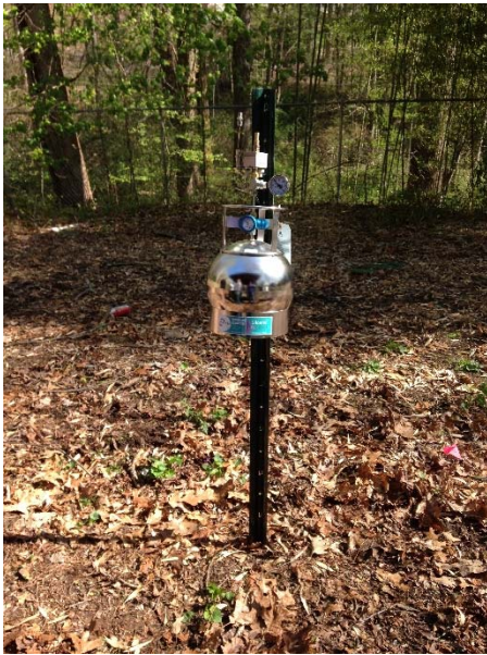
April 2014 - Summa canister collecting an outdoor air sample over a 24-hour period.

In 2012, AMEC conducted a Vapor Intrusion (VI) Assessment at several homes within Southside Village, which is adjacent to the western fence line of the former CTS manufacturing building. The results indicated that concentrations were within acceptable levels for residential land use.