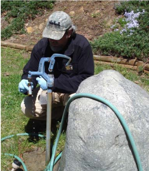
AMEC personnel collecting a well water sample in April 2014

The 2 nd quarterly drinking water sampling event of 2014 was completed during the week of April 14-18, 2014 . EPA will mail results to home owners after the results are received.