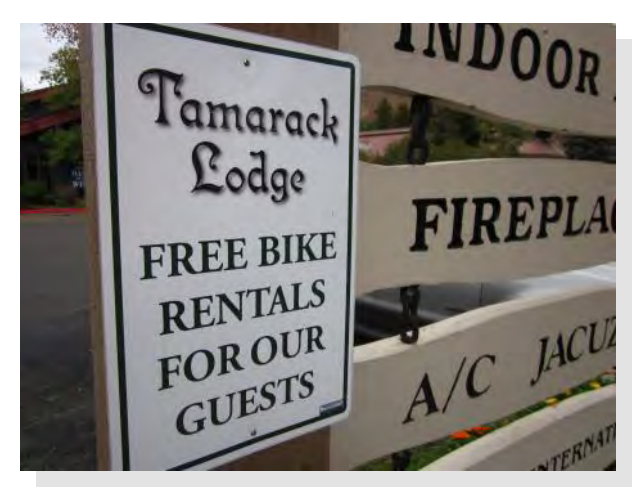
Changing demand among visitors has prompted businesses to offer different amenities. This hotel in Ketchum, Idaho is located downtown, across the street from a spur of the region's well-connected multi-use trails system.