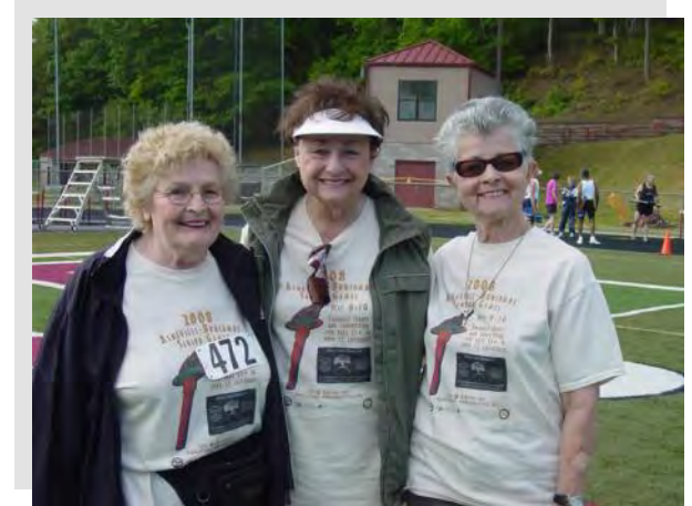
Buncombe County’s Parks, Greenways & Recreation Services Department already conducts and participates in numerous programs, such as the Senior Games, that utilize existing facilities and are perfect for staging at or near greenway corridors.