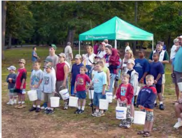
Buncombe County's Fishing Derby for Kids is an example of a recreational program where groups already engaged in other programs, such as Trout Unlimited, are well-suited to provide resources to support such events at little or no cost to government agencies.