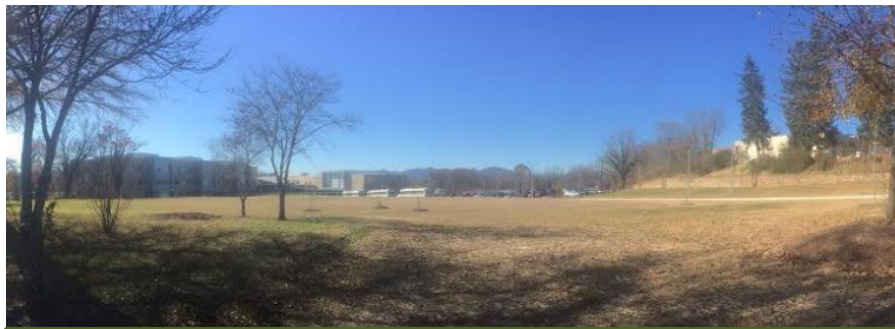
Asheville Middle School