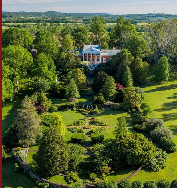
James & Elizabeth Monroe's Oak Hill