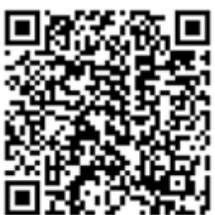
Hazard Mitigation Grant Program

Visit www.ncdps.gov or scan the QR code to learn more.